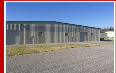
Guzzler Mfg Whse Upgrade Merit Winner Industrial Under $5 Million