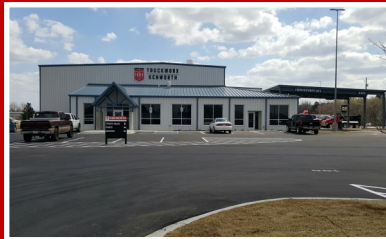
Truckworx of Montgomery Award Winner Commercial Under $5 Million