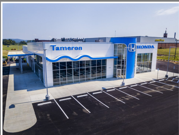
Recently completed Tameron Honda—Gadsden, AL

Plant Gadsden WWT Facility Foundations & Underground—Gadsden, AL Kaiser Aircraft Roof Replacement—Birmingham, AL SEPCO Fire Damage Building Repairs—Alabaster, AL Tractor & Equipment New Facility—Tuscaloosa, AL Signature Hangar Repairs—Mobile, AL Truckworx Renovations —Tuscaloosa, AL Tractor & Equipment Renovations—Huntsville, AL VT MAE Hangar 3 Modifications—Mobile, AL Research Solutions New Pelham Campus—Pelham, AL Plant Wansley CCR Project (PEMB) - Carrollton, GA Daikin Building E2 Addition—Decatur, AL Airport One Climate Control Storage—Mobile, AL University of Alabama Automotive Services Building—Tuscaloosa, AL SouthPoint Industrial Park PEMB Lot - Huntsville, AL Plant Miller WWM New Storage Warehouse—Quinton, AL SSAB EER8 & Rolling Mill Lab Roof Replacement—Axis, AL Warrior Met Coal New Office & Bathhouse—Brookwood, AL Iron City Ford—Birmingham, AL Lodge Manufacturing New Foundry—South Pittsburg, TN Cascades Sonoco Kitchen/Silo Addition—Birmingham, AL Fultondale City Hall Fire Damage Restoration—Fultondale, AL Outokumpu Stainless—Acid Regeneration Roof Repairs—Calvert, AL