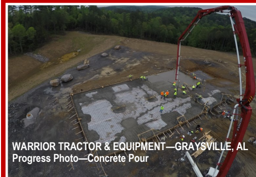
WARRIOR TRACTOR & EQUIPMENT—GRAYSVILLE, AL Progress Photo—Concrete Pour

Warrior Tractor & Equipment New Facility—Graysville, AL Warrior Tractor & Equipment New Facility—Huntsville, AL Kohler Expansion Concrete Package—Huntsville, AL Unifirst Laundry Warehouse Improvements—Orlando, FL Alabama Power Walnut Hill Substation—Birmingham, AL Plant Gorgas Unit 10 WWM Project—Parrish, AL James Hardie —Prattville, AL United Rentals Renovations—Pensacola, FL Boeing—Foundations & Flatwork—Huntsville, AL Boeing—S900 Metal Wall Panels—Huntsville, AL Norbord Dry Bin Penthouse & Sheeting—Lanett, AL Merryweather Foam Roof Retrofit—Sylacauga, AL Brown Eagle Versal Packaging—Baton Rouge, LA Alabama Power Northside Substation—Birmingham, AL SSAB Admin Renovations Phases 1-5—Axis, AL Southpoint 226 Foundations—Tanner, AL Southpoint 164 West Foundations—Tanner, AL Boeing—Building Interiors—Huntsville, AL