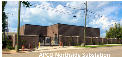
APCO Northside Substation